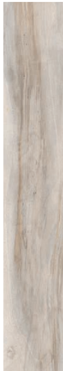
7.5 x 45 cm (3 x 18) RD.LV.TTA.0318