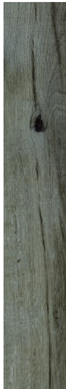
7.5 x 45 cm (3 x 18) RD.LV.NRO.0318

All items shown in this document are part of Olympia's stocking program. For special orders, please contact your Olympia Tile Sales Representative.