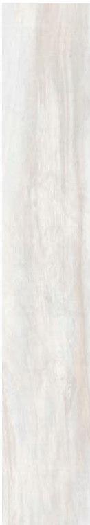
7.5 x 45 cm (3 x 18) RD.LV.BIA.0318