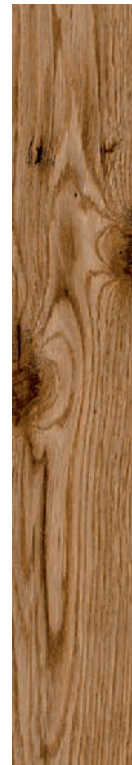
7.5 x 45 cm (3 x 18) RD.LV.NCE.0318

All items shown in this document are part of Olympia's stocking program. For special orders, please contact your Olympia Tile Sales Representative.