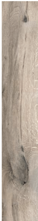
7.5 x 45 cm (3 x 18) RD.LV.CNR.0318