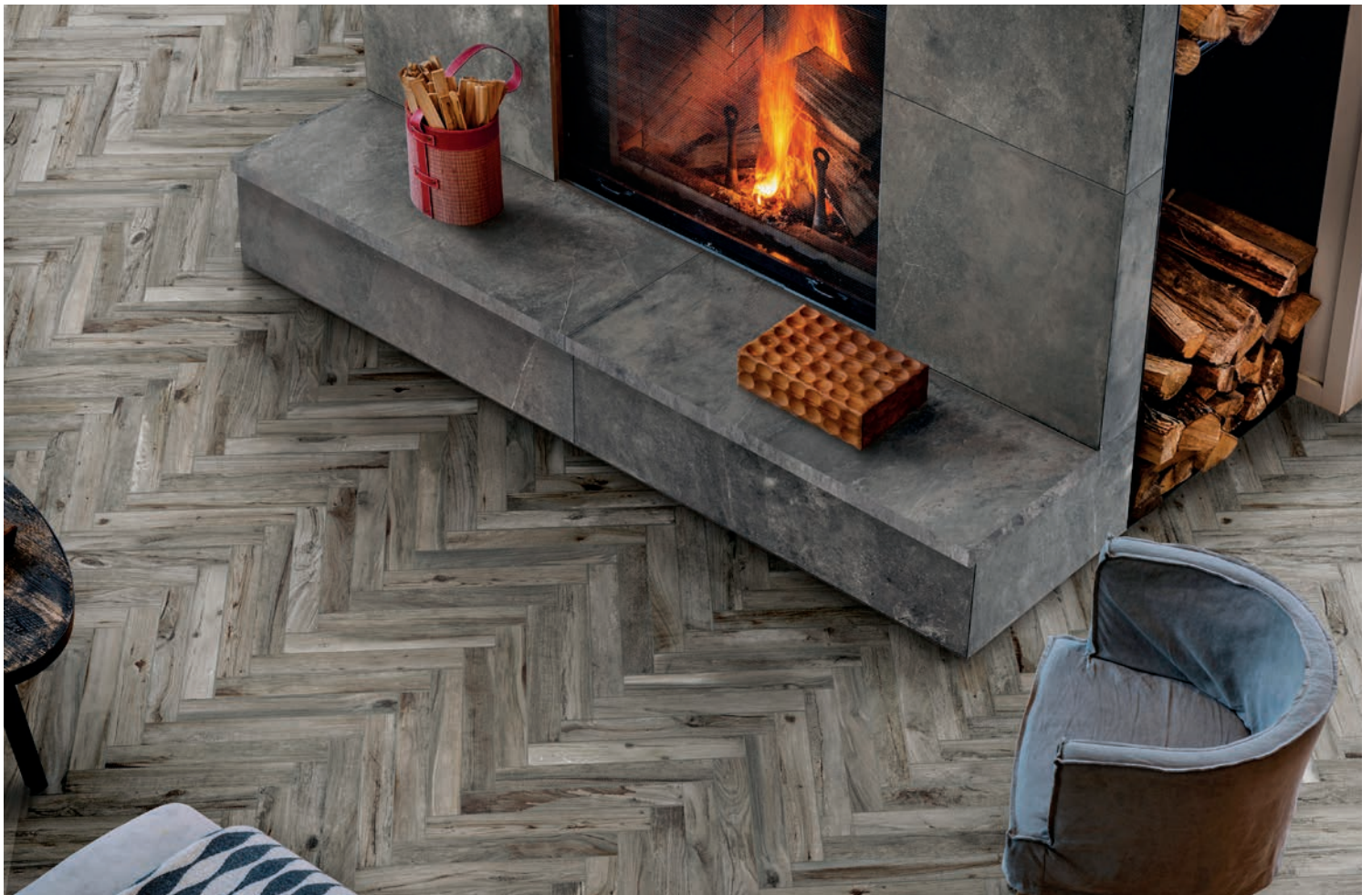
TORTORA (Warm Grey)