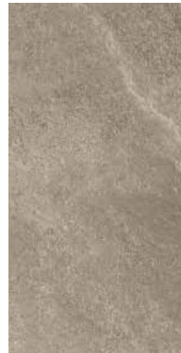
30 x 60 cm (12 x 24) SO.ST.TPE.1224.MT

All items shown in this document are part of Olympia's stocking program. For special orders, please contact your Olympia Tile Sales Representative.