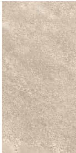
30 x 60 cm (12 x 24) SO.ST.SND.1224.MT