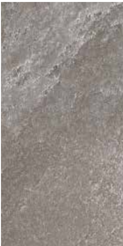
30 x 60 cm (12 x 24) SO.ST.GRY.1224.MT