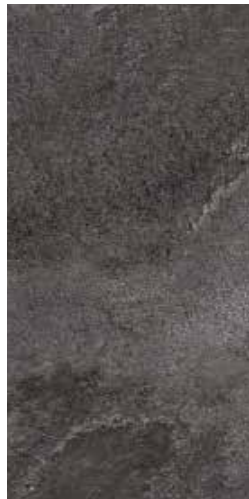
30 x 60 cm (12 x 24) SO.ST.DRK.1224.MT

All items shown in this document are part of Olympia's stocking program. For special orders, please contact your Olympia Tile Sales Representative.