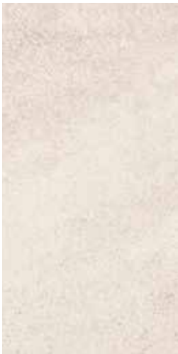
30 x 60 cm (12 x 24) SO.ST.LHT.1224.MT