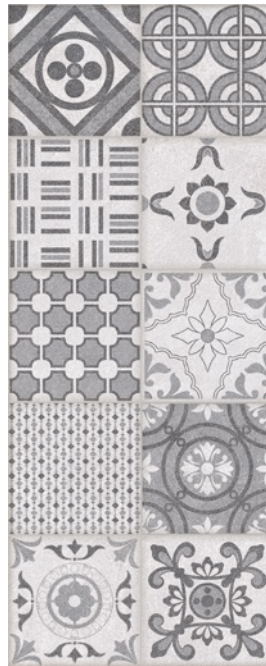
GREY PATCHWORK DECOR 20 x 50 cm (8" x 20") GE.GN.GRY.0820.MT.DC

All items shown in this document are part of Olympia's stocking program. For special orders, please contact your Olympia Tile Sales Representative.