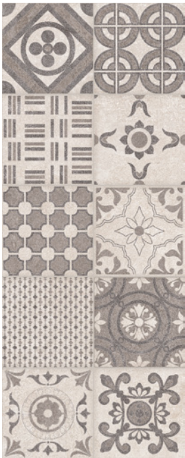
TAUPE PATCHWORK DECOR 20 x 50 cm (8" x 20") GE.GN.TPE.0820.MT.DC