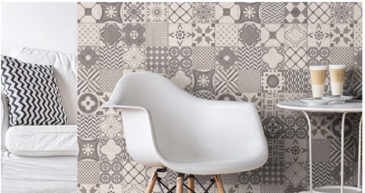
TAUPE 8" x 20" Matte Decor