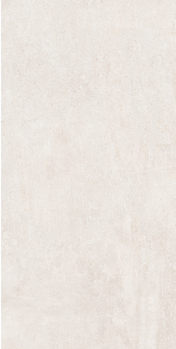
30 x 60 cm (12" x 24") GE.GN.WHT.1224.MT