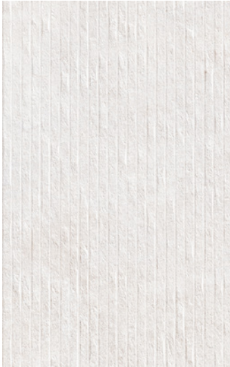
25 x 40 cm (10" x 16") Brick Relief Decor GE.GN.WHT.1016.MT.DC