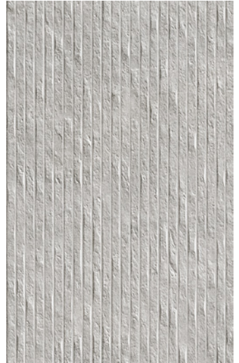
25 x 40 cm (10" x 16") Brick Relief Decor GE.GN.GRY.1016.MT.DC