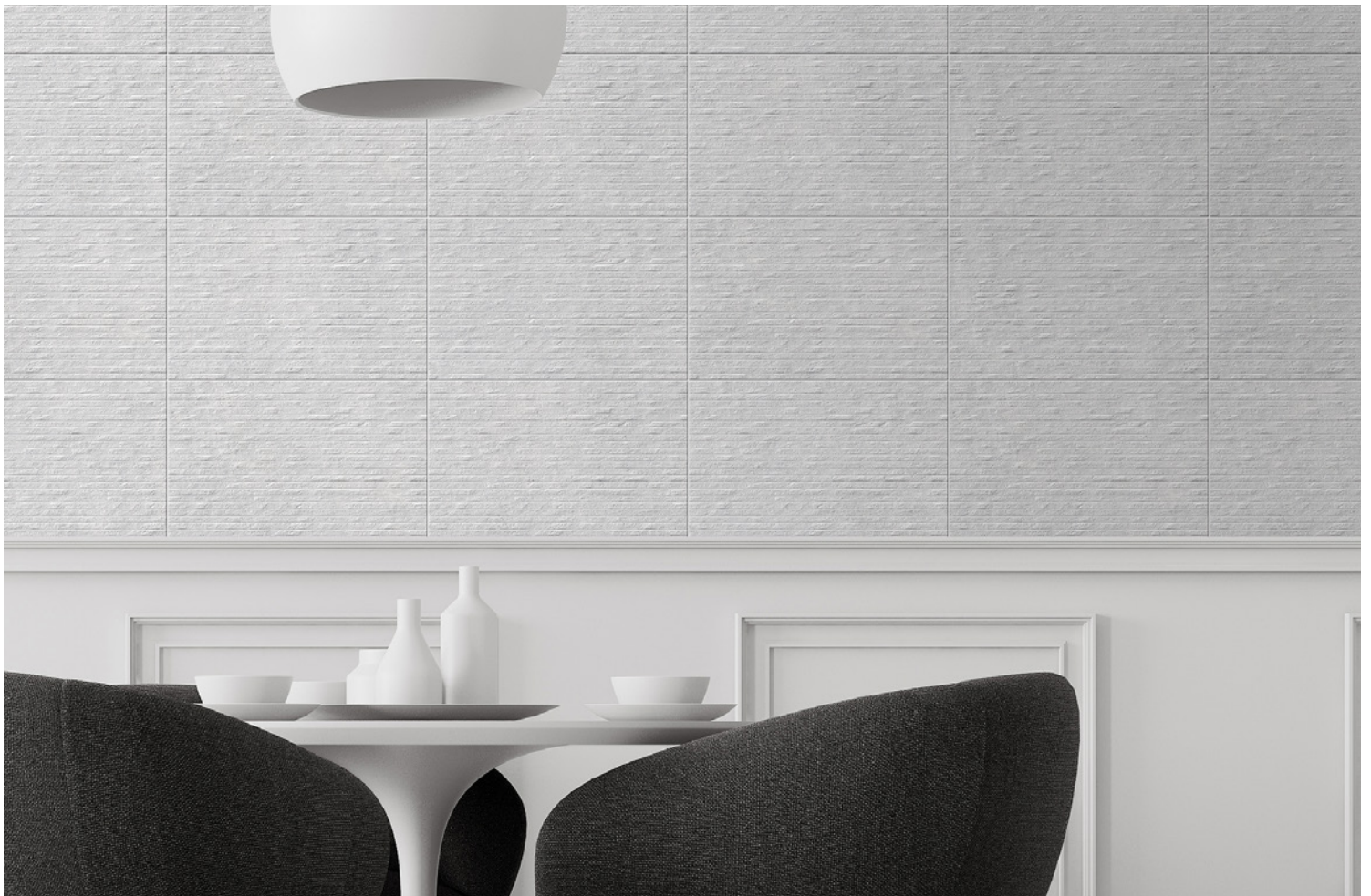
WHITE 10" x 16" Matte Decor