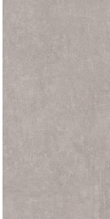
30 x 60 cm (12" x 24") GE.GN.TPE.1224.MT