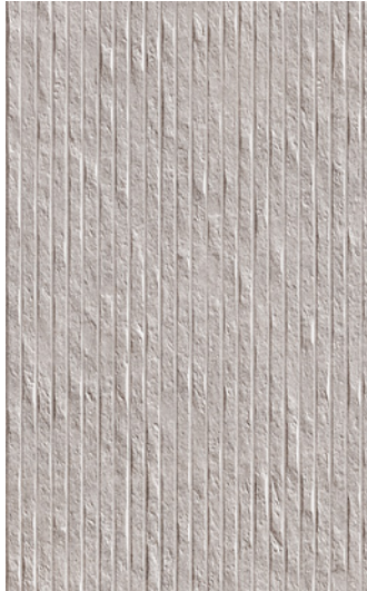
25 x 40 cm (10" x 16") Brick Relief Decor GE.GN.TPE.1016.MT.DC