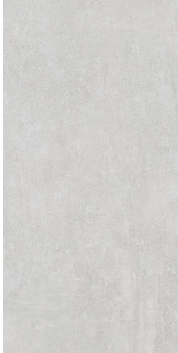
30 x 60 cm (12" x 24") GE.GN.LGR.1224.MT