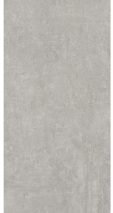
30 x 60 cm (12" x 24") GE.GN.GRY.1224.MT

All items shown in this document are part of Olympia's stocking program. For special orders, please contact your Olympia Tile Sales Representative.