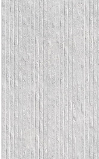
25 x 40 cm (10" x 16") Brick Relief Decor GE.GN.LGR.1016.MT.DC