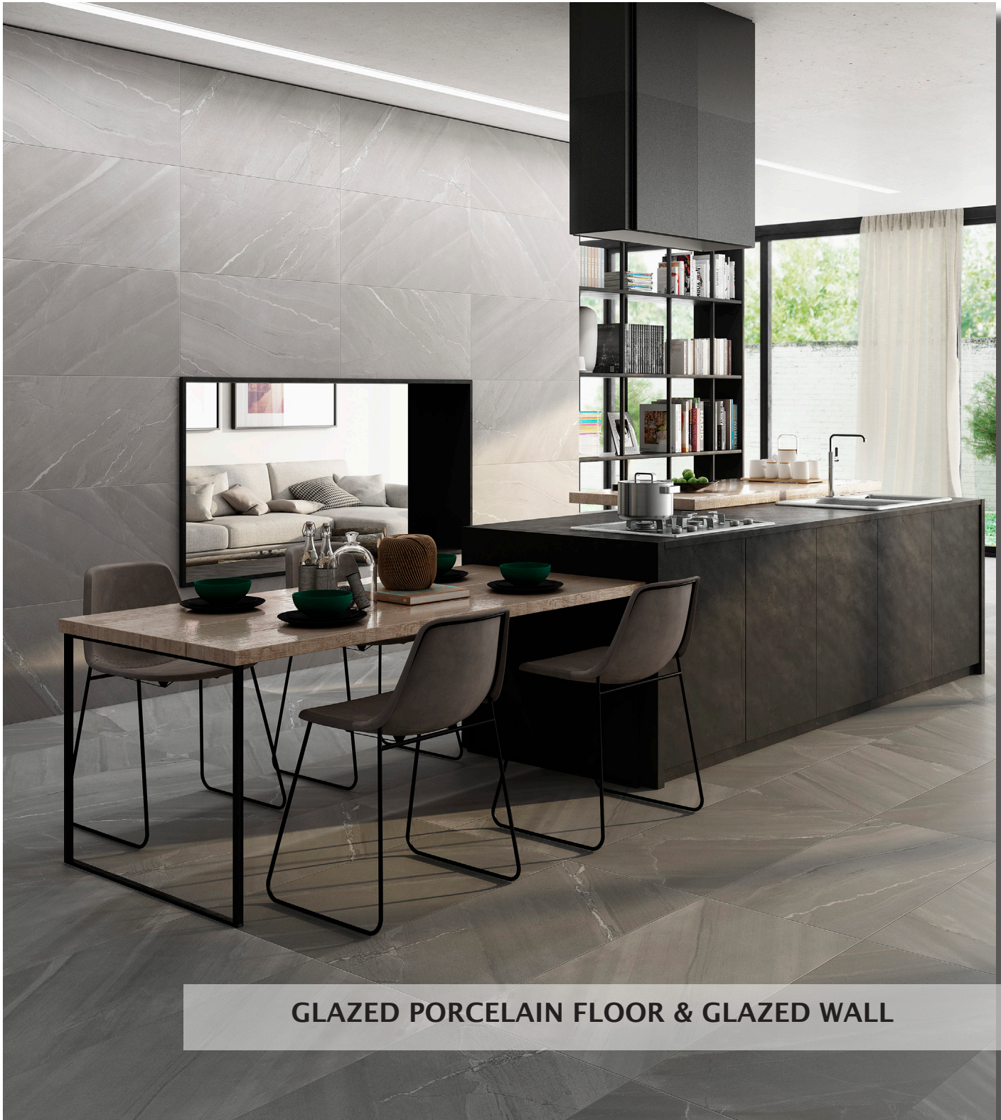
GLAZED PORCELAIN FLOOR & GLAZED WALL

The Burlingstone collection brings the beauty of natural stone to any environment with its realistic & delicate veining, that's designed with a modern color palette, for clean and sleek looks to match any style.