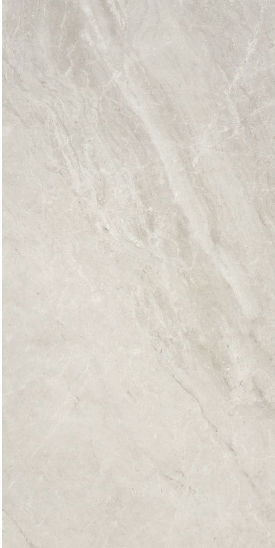
BLANCO 30 x 60 cm (11.82" x 23.63") Matte Finish UN.MR.BLC.1224.MT