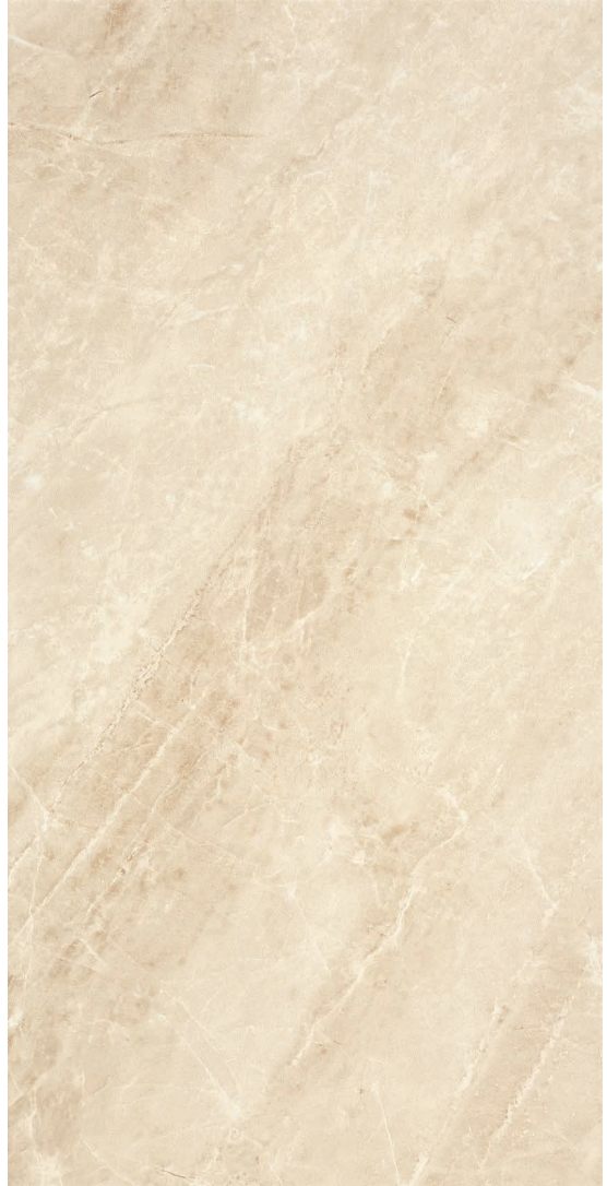
BEIGE 30 x 60 cm (11.82" x 23.63") Matte Finish UN.MR.BGE.1224.MT

All items shown in this document are part of Olympia's stocking program. For special orders, please contact your Olympia Tile Sales Representative.