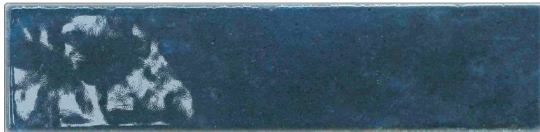
COBALTO Glossy Finish

6 x 25 cm (2.5" x 10") Code# KD.GE.COB.2,5x10