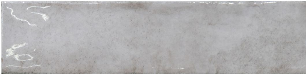
ARGENTO Glossy Finish

6 x 25 cm (2.5" x 10") Code# KD.GE.BIA.2,5x10