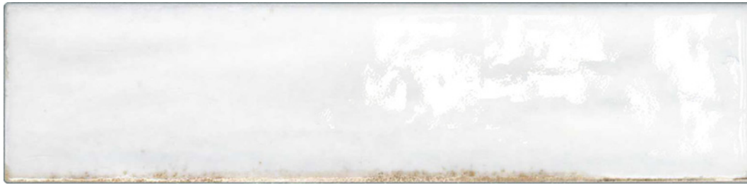
BIANCO Glossy Finish

6 x 25 cm (2.5" x 10") Code# KD.GE.BIA.2,5x10