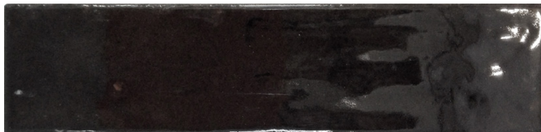
NERO Glossy Finish

6 x 25 cm (2.5" x 10") Code# KD.GE.COB.2,5x10