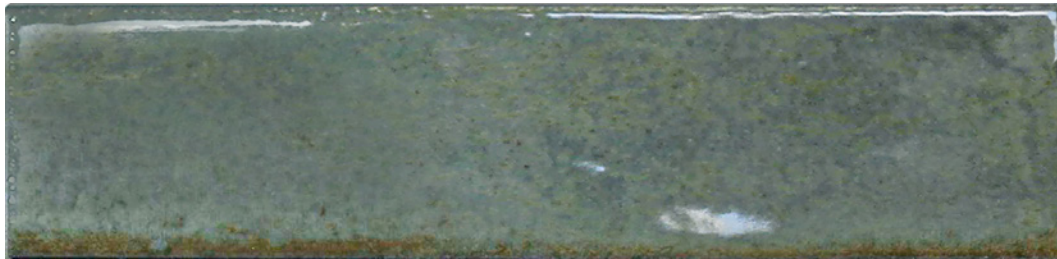
CARAIBI Glossy Finish

6 x 25 cm (2.5" x 10") Code# KD.GE.ARG.2,5x10