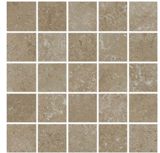
89123/M12 Clay 25pc