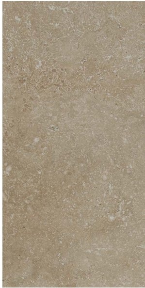
89123 12x24 Clay