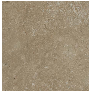
89123 12x12 Clay