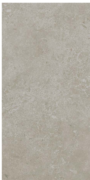
89132 12x24 Sand