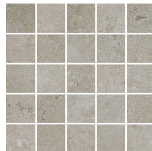
89132/M12 Sand 25pc