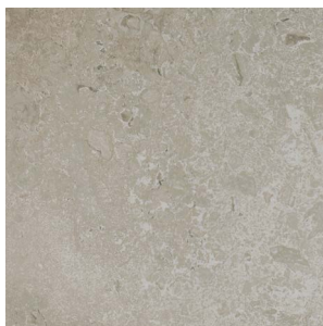
89132 12x12 Sand