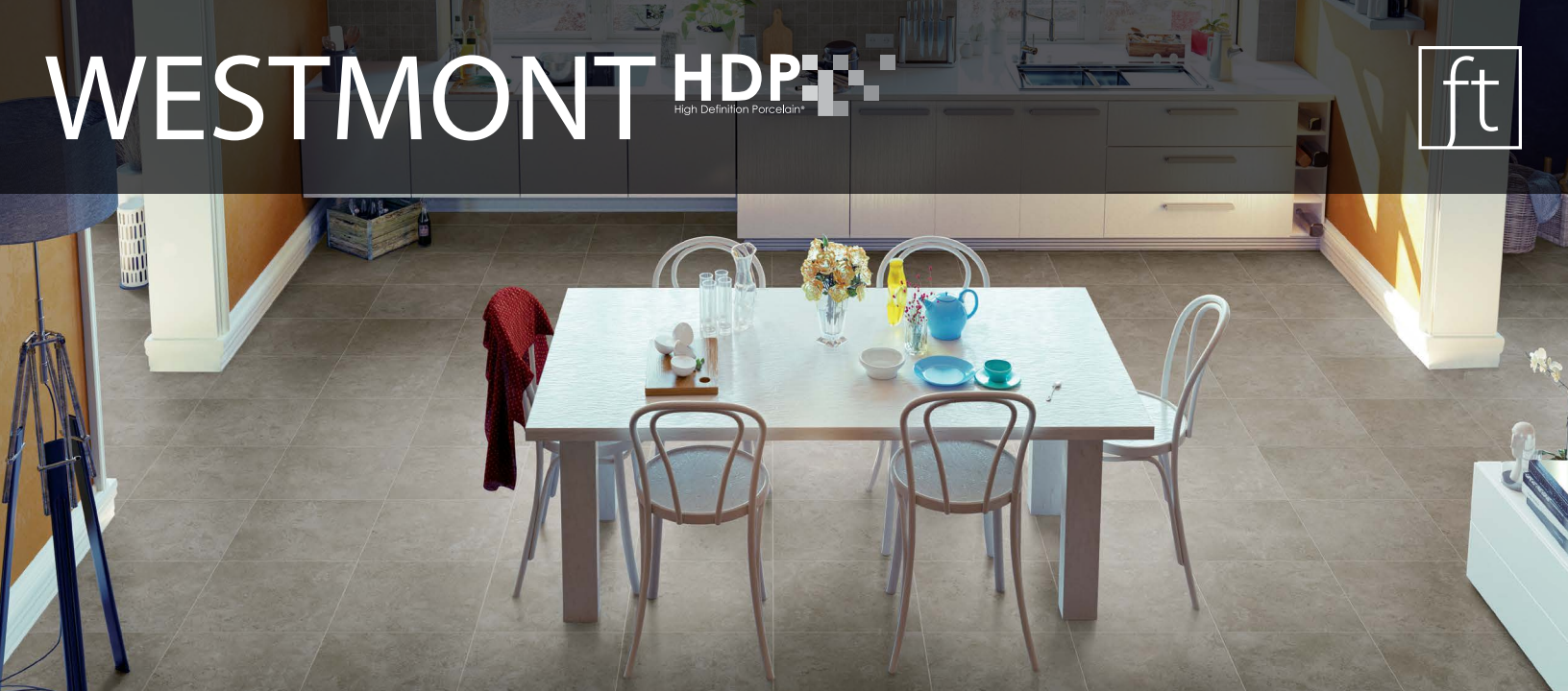
above: 89132 12x12 Sand