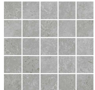
89103/M12 Quarry 25pc