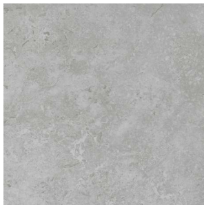
89103 12x12 Quarry