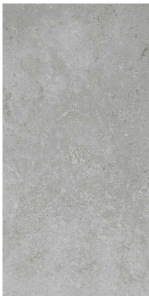
89103 12x24 Quarry