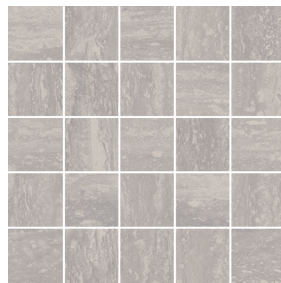
GVT30/M12 25pc Mosaic