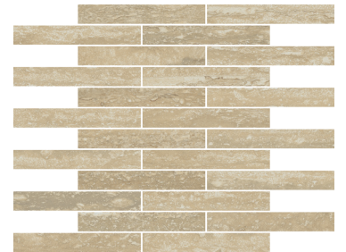
GVT20/M1x6BRICK Offset Brick Mosaic