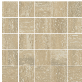
GVT20/M12 25pc Mosaic