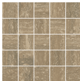
GVT40/M12 25pc Mosaic