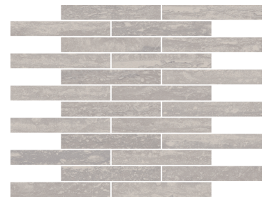
GVT30/M1x6BRICK Offset Brick Mosaic