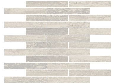
GVT10/M1x6BRICK Offset Brick Mosaic