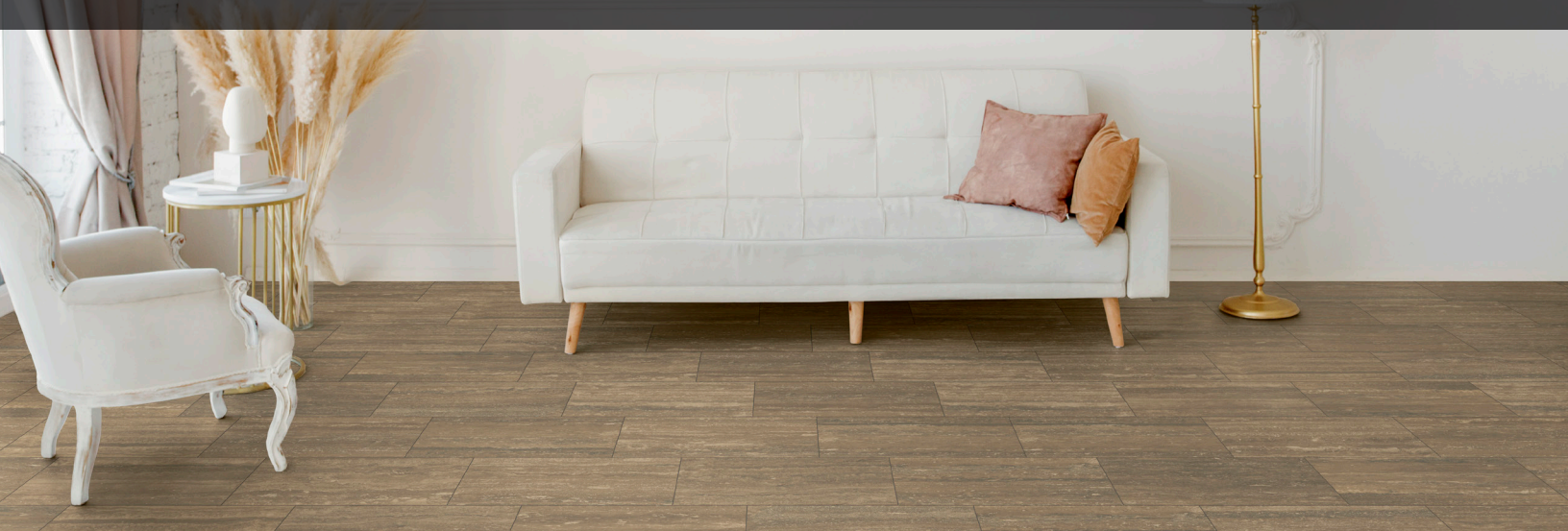
above: GVT40 12x24 Natural