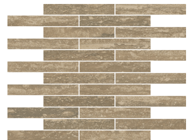
GVT40/M1x6BRICK Offset Brick Mosaic