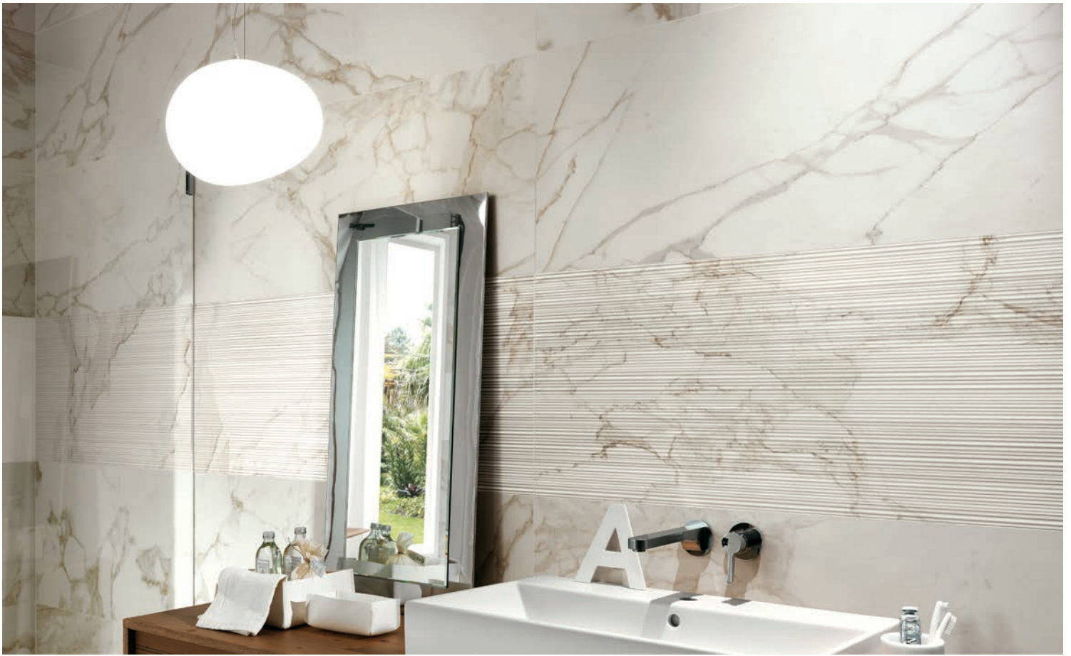
Calacatta and Calacatta Filo Decor