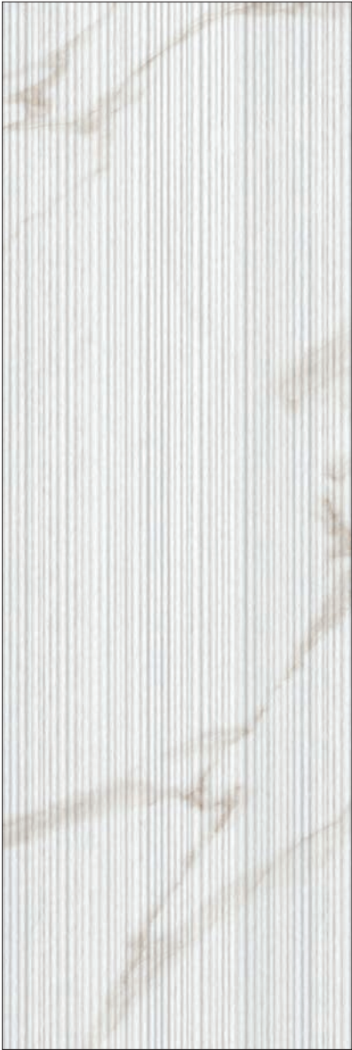
Filo Decor 25 x 75 cm (10 x 30) FO.RM.CAL.1030.FILO

All items shown in this document are part of Olympia's stocking program. For special orders, please contact your Olympia Tile Sales Representative.