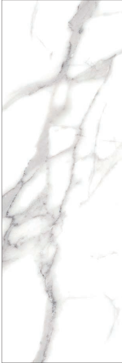
25 x 75 cm (10 x 30) FO.RM.STT.1030