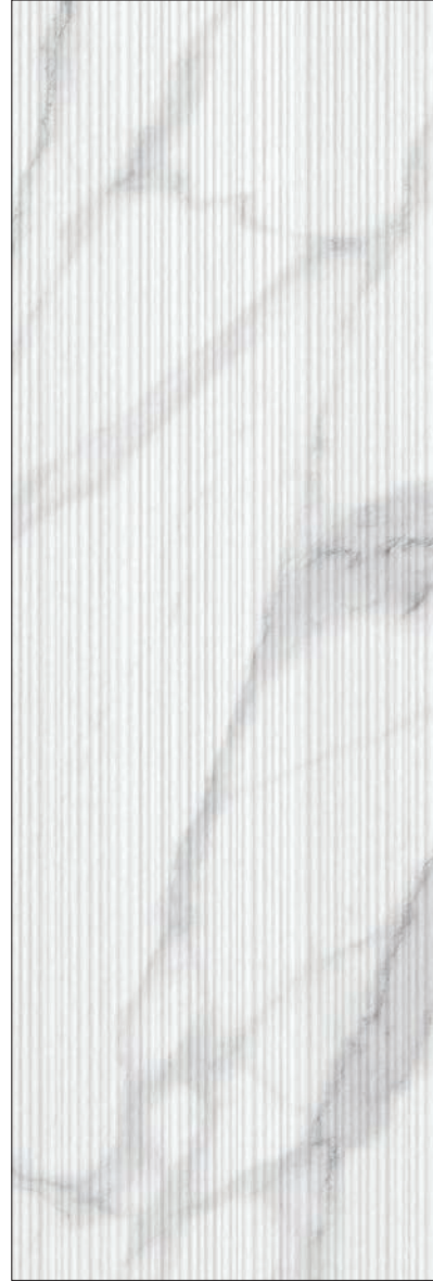
Filo Decor 25 x 75 cm (10 x 30) FO.RM.STT.1030.FILO

All items shown in this document are part of Olympia's stocking program. For special orders, please contact your Olympia Tile Sales Representative.