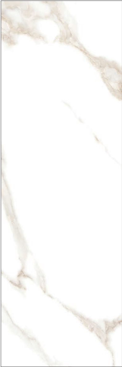
25 x 75 cm (10 x 30) FO.RM.CAL.1030